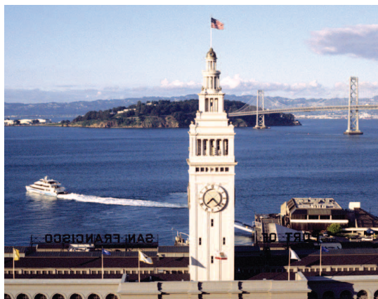
The San Francisco Ferry Building