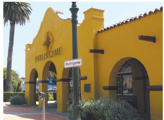
Burlingame Railroad Station, built in 1894, is listed on the National Register of Historic Places

MILLBRAE BART: Caltrain to Santa Clara Station, transfer to VTA's Airport Flyer, Route 10