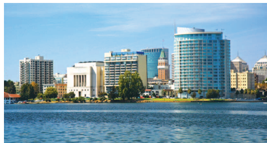
Lake Merritt and the Oakland skyline

Oakland Convention Center 12TH STREET/OAKLAND CITY CENTER BART