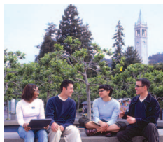
University of California at Berkeley campus