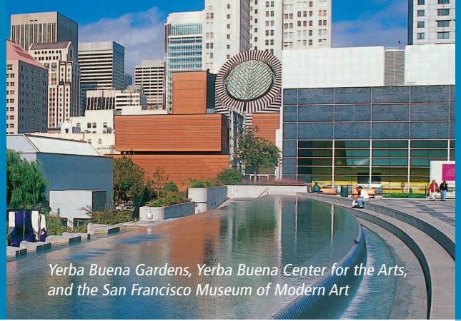
Yerba Buena Gardens, Yerba Buena Center for the Arts, and the San Francisco Museum of Modern Art

Stunning views, historic landmarks, culturally diverse cuisine and shopping—all spread throughout an eclectic mix of neighborhoods—make San Francisco a world-class destination. There truly is something for everyone in this one-of-a-kind city.