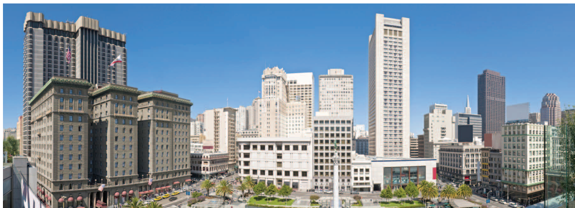
Downtown San Francisco's Union Square