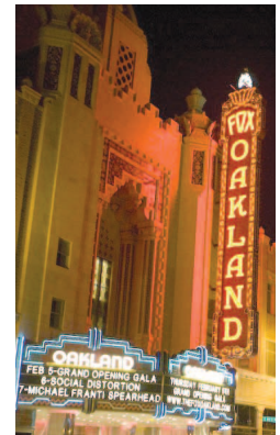
Oakland's Fox Theater

Golden Gate Fields NORTH BERKELEY BART: Free shuttle during track season